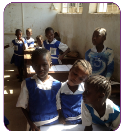
First Grade Students