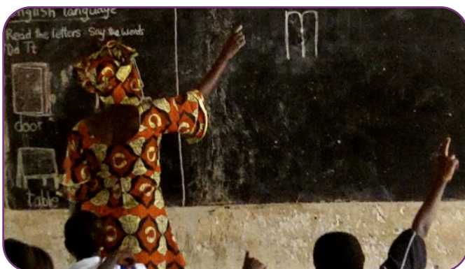
Learning Letter Formation with Air-Writing